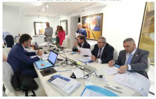
Members of the institutional delegation