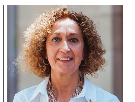
Ester Capella, Minister of Territory of the Catalan Government