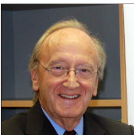
MR. CARLOS WESTENDORP Secretary General Club de Madrid