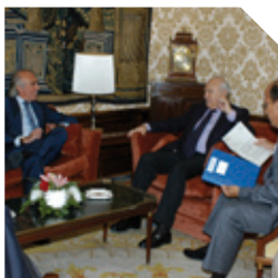
30 SEPTEMBER 2008 Presentation of the Foundation to Minister Miguel Ángel Moratinos