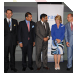
21-23 JUNE 2010 Global India Business Meeting