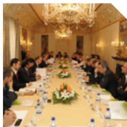
1 APRIL 2009 First meeting of the Board - Presentation to the media