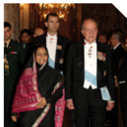
20-23 APRIL 2009 The Foundation, present at the state visit to Spain of Her Excellency the President of the Republic of India